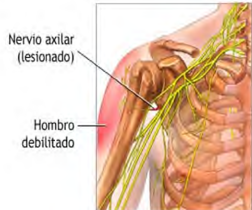
Figure 4. Axial nerve injury http://www.clinicadam.com/imagenes-de-salud/8729.html