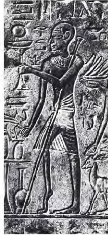
Figure 1. Image recorded on grave Hirkouf (2,830 BC)

http://www.ujaen.es/investiga/cts380/historia/civilizaciones_antiguas.htm